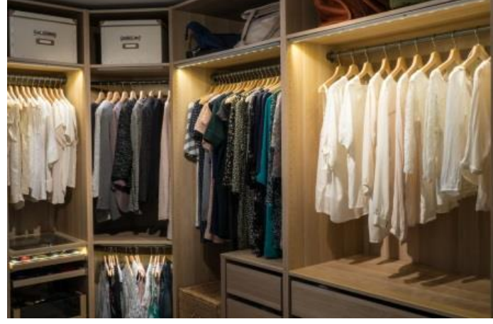
39 Years of Service Expertise